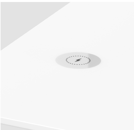
The charging sticker highlights area where your device will need to be placed for convenient charging