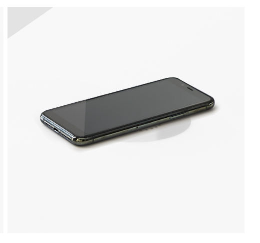
Simply place mobile device on the charging sticker to charge