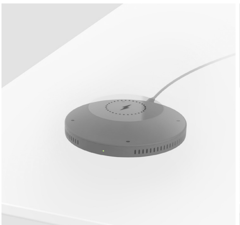
NeatCharge is mounted under the worksurface, directly below the location of the charging sticker